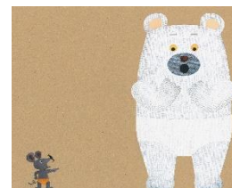
Polar Bear's Underwear